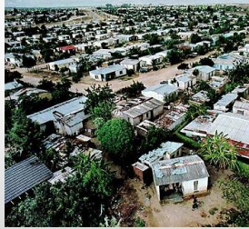
Lagos, Nigeria, Africa (pop ~15mil)